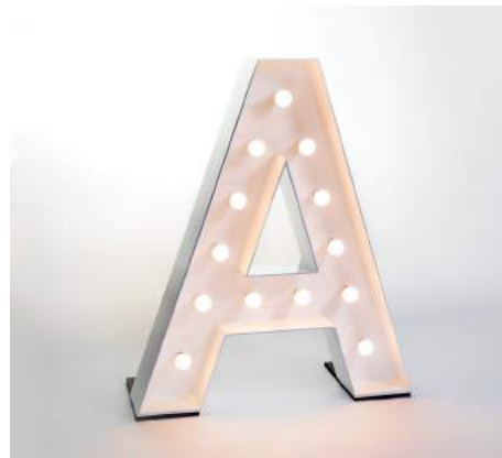
Light Up Letters/Numbers