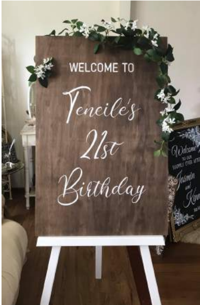
Walnut Welcome Sign