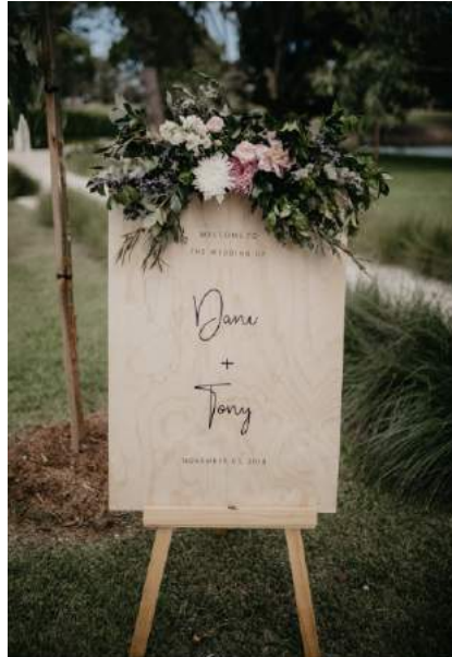
Pine Welcome Sign